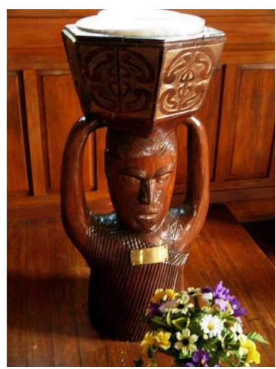
Figure 10. Taumata-ā-Kura baptismal font(Te Runanganui o Ngāti Porou, 2019).