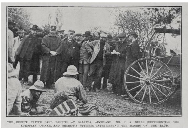
Figure 5. Native land dispute at Galatea(Auckland Weekly News, 1906).

As well as the school house and wharenui, Patuheuheu had to leave behind their church and the sacred bones of their dead (Binney, 2001, 2009a, 2010). Paul (1995) claimed that the ancestral remains were uplifted and relocated around the time of Patuheuheu's eviction, while Binney (2001, 2009a, 2010) maintained that Patuheuheu did not return to Te Houhi to collect their ancestral bones until 1924. Some accounts claimed that the government purchased the wharenui from Grant for £140 in 1908 (Binney, 2001, 2009a, 2010; Boast, 2002; Paul, 1995).