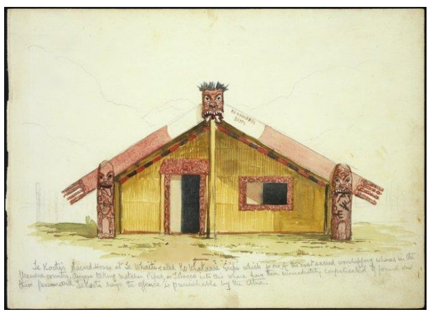
Figure 3. Eripitana wharenui, 1891 (Thomas, 1891).

As Te Kooti approached the wharenui, his horse shied, and he noticed an inverted carved figure. Salmond (1976) claimed that the carver of Eripitana had 'accidentally inverted a carving motif' (p. 67). Salmond (1976) implied that it was owing to the error of the inverted carving that Te Kooti expressed his prophetic words on the pou mua—a front post of the wharenui (Moorfield, 2011; see Figure 7): 'its wide mouth turned upside-down, ready to devour everything around it' (Binney, 1997, p. 326). Te Kooti then uttered a prophecy of destruction: