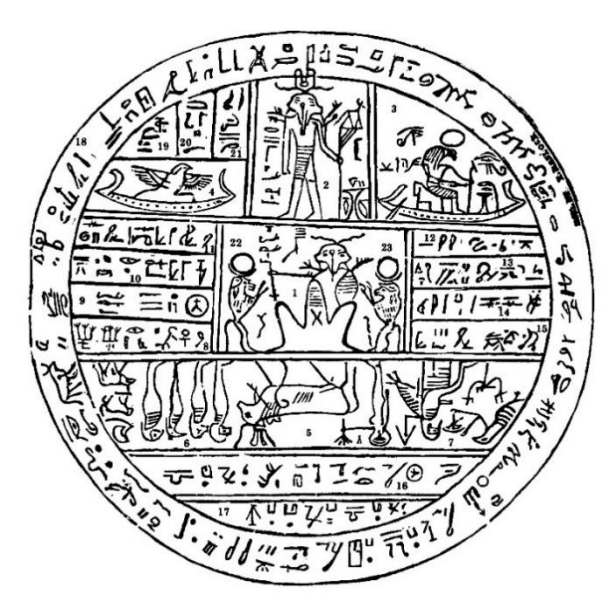
Figure 9. A facsimile from the 'Book of Abraham, No. 2', The Pearl of Great Price.

Mormon theology also insists that God is glorified flesh and bone. Unlike in Orthodox Christianity, Jesus is believed to be separate from God, not God's human incarnation. Paulsen (1995) referred to this as 'divine embodiment', stating that 'the doctrine that God the Father and God the Son are embodied persons, humanlike in form, has rich implications for both philosophical anthropology and theology, and it is one of the most distinctive teachings of the Restoration' (p. 7). I agree that while the doctrine of the Church leaves room for interpretation regarding the afterlife, Mormon conceptualisations of exaltation do tend to include godhood and the creation of worlds.