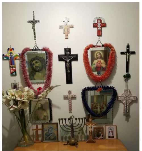
Figure 7. A small section of my collection of religious iconography.

purple stole—the intense prayers and the fanatical sprinkling of holy water, rather than the terrifying contortions of Regan's ragged body. Certainly, an obsession with crucifixes and Christian iconography would become part of my ongoing theological explorations in life.