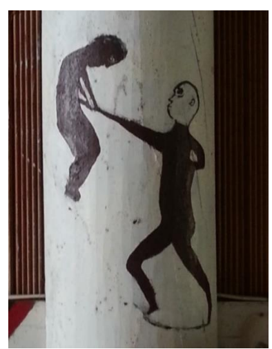
Figure 2. Bayonet scene on heke (rafter) inside Tama-ki-Hikurangi wharenui, Patuheuheu marae, Waiōhau

On 10 April 1869, Te Kooti attacked Mōhaka in the northern Hawke's Bay area (Belich, 1986; Binney, 1997). Painted on a rafter inside Tama-ki-Hikurangi wharenui at Patuheuheu marae in Waiōhau is a motif that 'shows the act of bayoneting, following Psalm 63, understood to refer to the killings at Mōhaka in 1869' (see Figure 5; Binney, 1997). During this attack by Te Kooti, 'people were caught sleeping and all were killed, even babies, who were thrown up in the air and bayoneted' (Neich, 1993, p. 261).