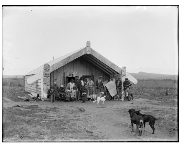
Figure 6. Group outside a meeting house at Rangitahi pā, Murupara(Pringle, ca. 1905).

painted figures. The one to the far right, described as painted in a checkered suit, is claimed to be Te Kooti.