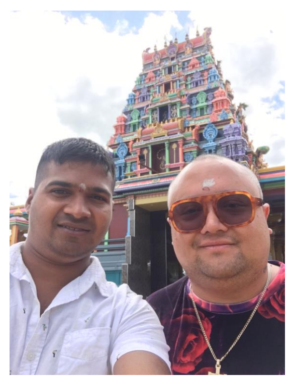
Figure 11. Sri Siva Subramaniya Temple, Nadi, Fiji, September 2019

I have owned and displayed various forms of Ganesha—whom I remain very fond of—in my home and office for more than a decade. The symbolism behind his physical attributes—which I apply to my life—is described as follows: wide ears to listen more; small mouth to speak less; large head and large brain to think and remember; small eyes to focus; two to 16 arms to accomplish great tasks, although Ganesha is usually shown with four arms (Dutta, 2016); one remaining, unbroken tusk to keep the good and discard the bad; a long trunk to be efficient and adaptable; and a large belly to digest the positives and negatives of life (Kumar et al., 2008).