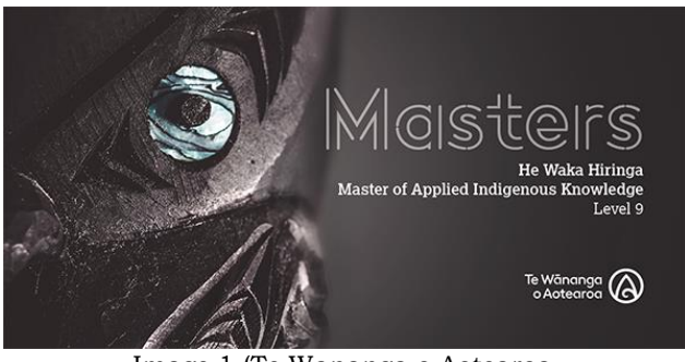
Image 1

emerged from the interviews. Last, this paper will identify the particular benefits that were experienced by the students from their publishing efforts.