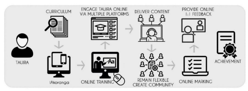
Figure 2: Online Learning Plan (Simati-Kumar & Rangiwai, 2020, p. 8).

planning mechanism in the first instance, but also served to reassure students that their lecturers were secure in their online teaching practice.