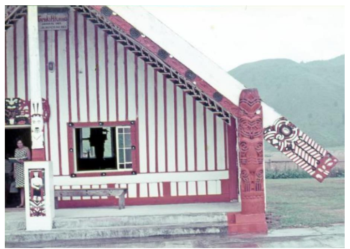
Figure 7. Tama-ki-Hikurangi (Mead, 1970, PID530316).

Archaeological evidence shows that early Māori houses were like those found elsewhere in Polynesia (Brown, 2009; Paama-Pengelly, 2010). When groupings of Māori reached Aotearoa from central Polynesia in waves from about 1350, they modified their building techniques to match the colder temperatures and different materials; Māori whare were small, simple and semi-permanent (Brown, 2009; Paama-Pengelly, 2010). However, in the nineteenth century, this was to change.