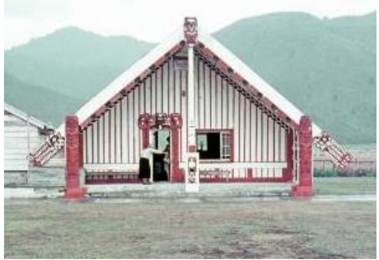
Figure 1. Tama-ki-Hikurangi (Mead, 1970, PID530310)