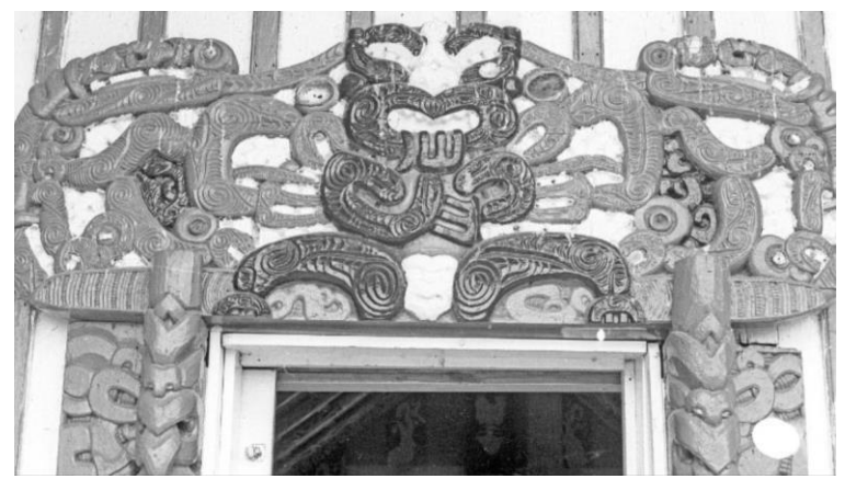
Figure 8. Door lintel (Mead, 1970, PID374214)

Within the Mataatua confederation of tribes—which includes Tūhoe, and by extension Patuheuheu—and under Te Kooti's revelation and leadership, large whare were constructed; these whare were sizeable enough to walk around inside, and some were as large as Christian churches (Brown, 2009; Paama-Pengelly, 2010).