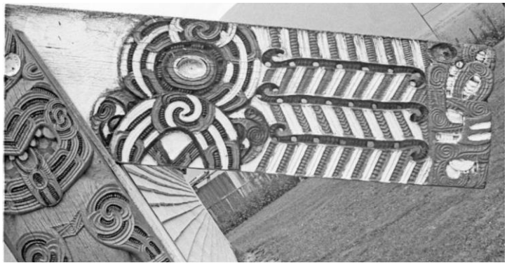
Figure 10. Exterior carvings (Mead, 1970, PID374258)

This new style whare featured polychromatic painted carvings and motifs—some in European artistic style portraying historical events (Brown, 2009; Paama-Pengelly, 2010). The various whare built for Te Kooti communicate an impressive critical awareness that embodies the power of his leadership, his beliefs in justice in the face of land loss and death, as well as spiritual redemption (Rangiwai, 2017).