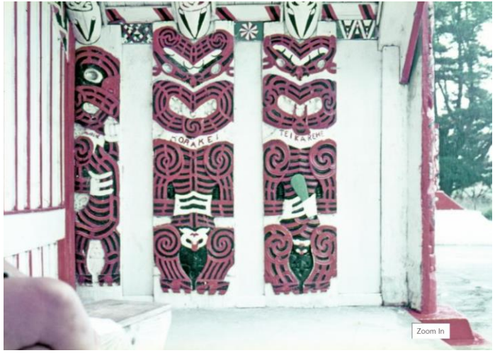
Figure 11. Tama-ki-Hikurangi (Mead, 1970, PID530320)

This new style whare featured polychromatic painted carvings and motifs—some in European artistic style portraying historical events (Brown, 2009; Paama-Pengelly, 2010). The various whare built for Te Kooti communicate an impressive critical awareness that embodies the power of his leadership, his beliefs in justice in the face of land loss and death, as well as spiritual redemption (Rangiwai, 2017).