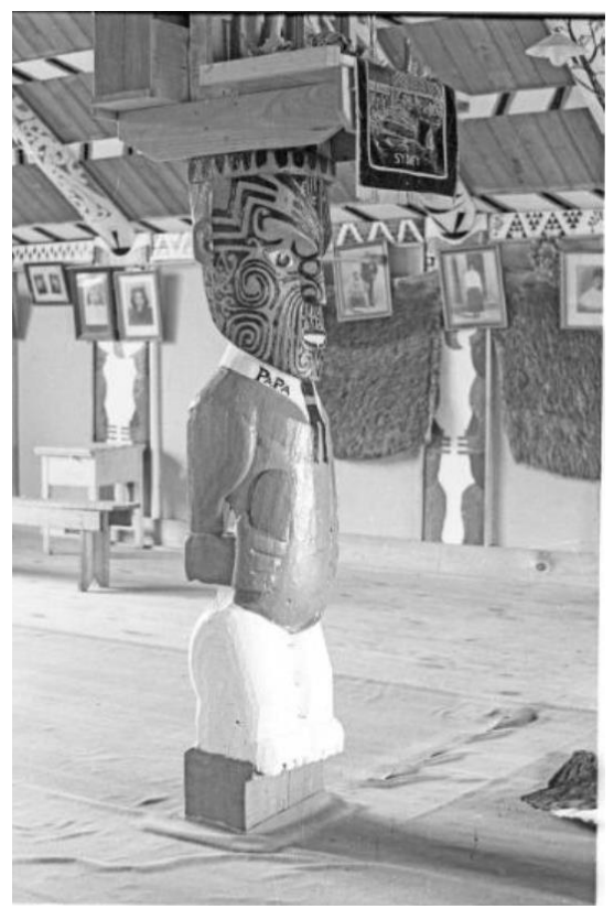
Figure 12. Interior carving (Mead, 1970, PID374216).

As Brown (2009) states: "By combining the functions of religious worship and political debate, Te Kooti and his followers created an architecture that was in sympathy with the needs and outlook of its users" (p. 60).