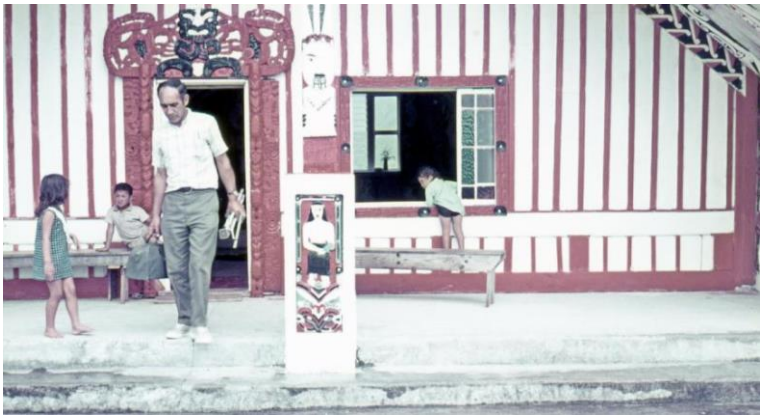
Figure 14. Tama-ki-Hikurangi (Mead, 1970, PID530314). Note Sir Hirini Moko Mead is featured in this image.

Patuheuheu were forced to leave behind their whare, a church and schoolhouse, and the sacred bones of their dead (Binney, 2001, 2009, 2010). Some reports argue that the government later purchased the whare from Grant, who used the whare as a haybarn, for £140 in 1908 (Binney, 2001, 2009, 2010; Boast, 2002; Paul, 1995). Notwithstanding the various accounts, it is clear that the people removed and relocated the whare piece by piece, refusing all assistance, except for a £40 grant from the government to purchase food for those without (Binney, 2001, 2009, 2010). According to Binney (2001, 2009, 2010), the whare would have been moved by wagon. Nevertheless, local oral accounts claim that the whare was transported in parts via the Rangitaiki River. Tama-ki-Hikurangi was re-opened at Waiōhau on 28 July 1909 (Binney, 2001, 2009, 2010; Paul, 1995).