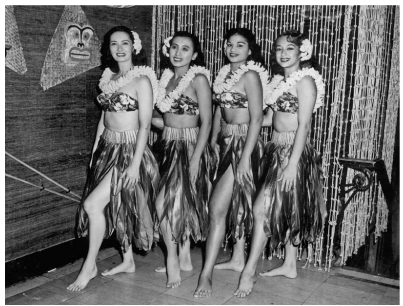
Figure 3: Women of Hapa Haole Hula. (2015)

indigenous people of Hawai'i. Descriptions such as exotic, welcoming, hospitable, and entertaining are used to depict Native Hawaiians".