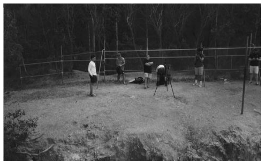
Figure 1: Last day of interviews in Logan, Brisbane (September, 2020)