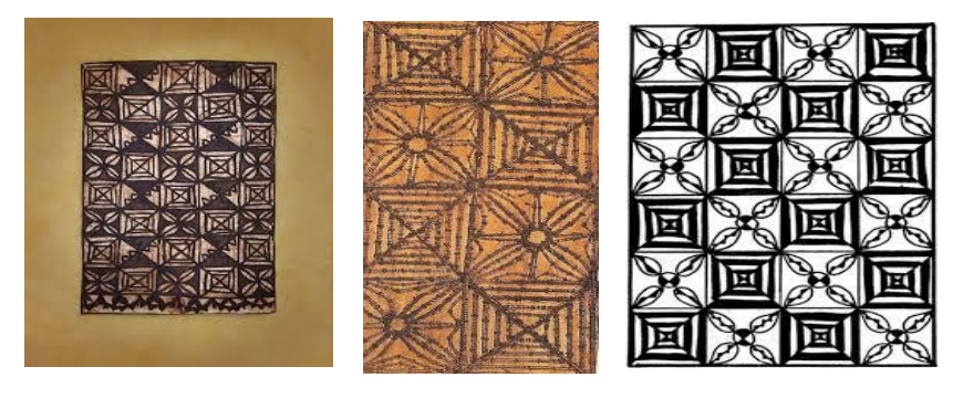
Figures 2-4: Example variations of Fata 'O Tu'i Tonga (Kapa Kulture, 2013)