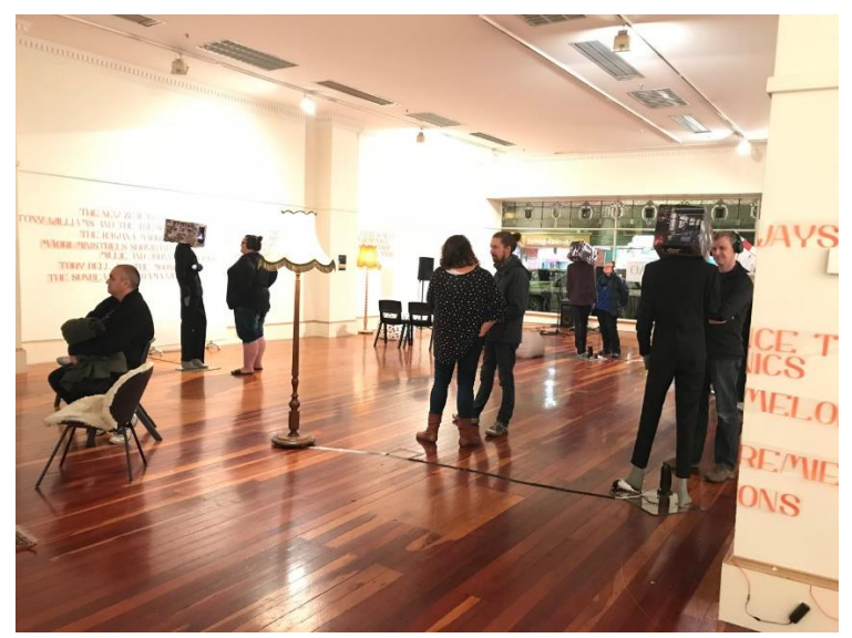
Figure 5. Rickie Kewene, He Kohinga Pao: The Exhibition, image C, 2018, Kewene-Doig personal collection.