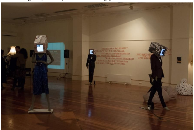
Figure 4. Rickie Kewene. He Kahinga Pao: The Exhibition, image B, 2018, Kewene-Doig personal collection.