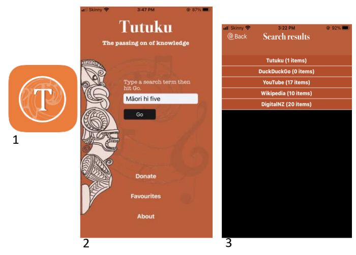
Figure 1. Louise Kewene-Doig, "Tutuku Screens," 2021, Louise Kewene-Doig, Dunedin.

Figure 2 below is an example of the researchinformed commentary being created for Tutuku. A normal internet search of The Māori Castaways may standalone photograph with little return а information, but I can create meaningful commentary which sits alongside the photograph giving the reader greater information about the subject. The informed commentary is an addition to the institutional, public and archival information currently available online. At this stage the information used to create the written content is informed by research completed for my PhD thesis.