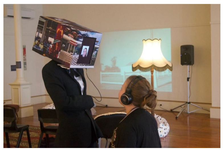
Figure 3. Rickie Kewene, He Kohinga Pao: The Exhibition, image A, 2019, Kewene-Doig personal collection.